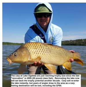
The carp at Lake Ogallala are just reaching trophy size since the last "renovation" in 2009 (20 pound class fish). Renovating the lake now will set back the trophy potential another decade. Carp will re-enter the lake instantly, but years of angler draw to the area as a carp fishing destination will be lost, including the GPRB.

As we all know, Nebraska has abundant and beautiful natural resources that all citizens use. Game and Parks play a vital role in protecting, managing, and allowing access to these resources for fishing, hunting, camping, hiking, and other outdoor activities. Veterans are large users and spend significant sums of money using these resources to escape their trauma and heal.